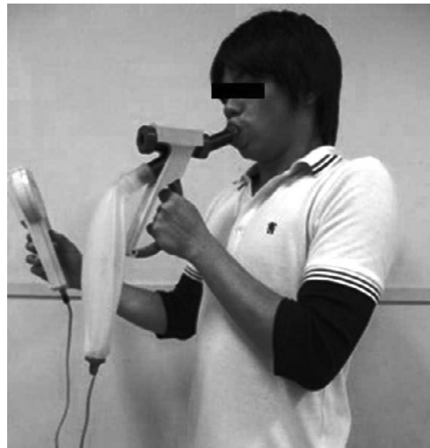
Figure 2 — Respiratory-muscle exercise.

The spinal-curvature angles are shown in Table 2. Statistical analysis revealed a significant difference within the exercise group for the preexercise to postexercise values for all parameters measured, indicating a decrease in the TH ( -13.1\% ) and L ( -17.7\% ) angles after the intervention